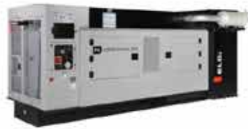
Diesel Portable (Skid) 475 - 1500 cfm / 150 - 400 psi