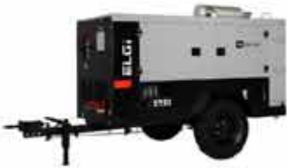
Diesel portable (Trolley) 185 - 1100 cfm / 100 - 300 psi