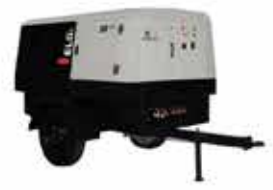
Electric Portable (Trolley) 22 - 75 kW / 131 - 490 cfm