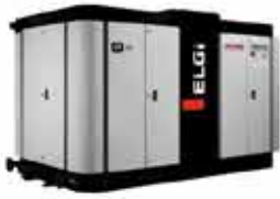
Oil-Free Series Screw 90 - 450 kW / 480 - 2515 cfm