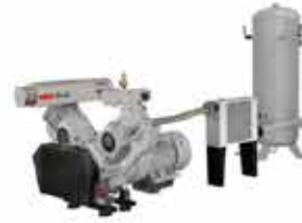
Oil-free Recip 1.0 - 75 HP / 1.8 - 300 cfm