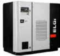
EG Series Rotary Screw 11 - 250 kW / 47 - 1612 cfm