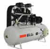
Oil-lubricated Recip 1.0 - 40 HP / 2.0 - 128 cfm