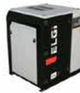
EN Series Rotary Screw 2.2 - 45 kW / 8.0 - 283 cfm