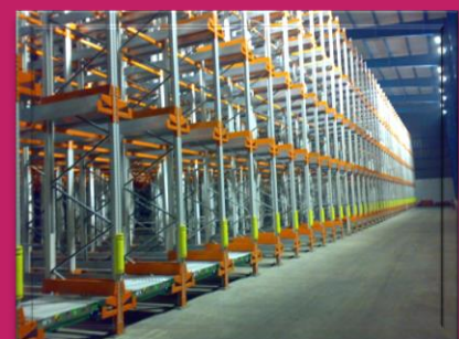
Shuttle Pallet Racking

Our solutions, perfected with decades of experience and our highly trained installation team, backed with world-class production facility enable us to provide our clients with superior storage solutions.