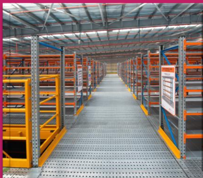
Heavy duty shelving systems