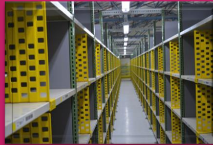
Boltless shelving Systems