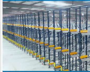
Drive in Pallet Racking