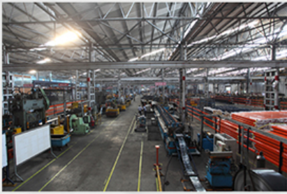
State-of-the-art, high-capacity automated manufacturing facility