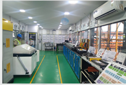
Comprehensive in-house testing facility for assured quality