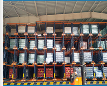
Shuttle Pallet Racking System