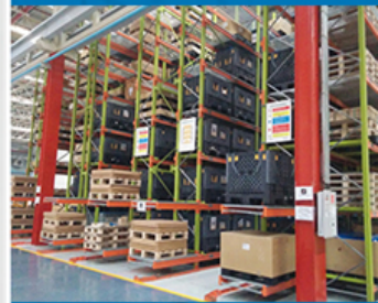
Very Narrow Aisle Pallet Racking System