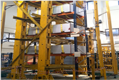
Tested seismic racking