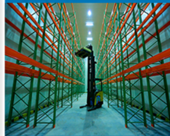
Double Deep Pallet Racking