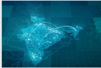
13 branches & 75+ channel partners serving all locations across the country