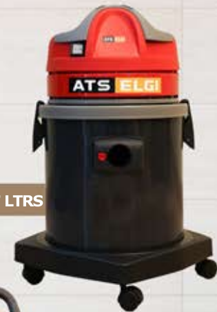
MID VAC- 37 LTRS