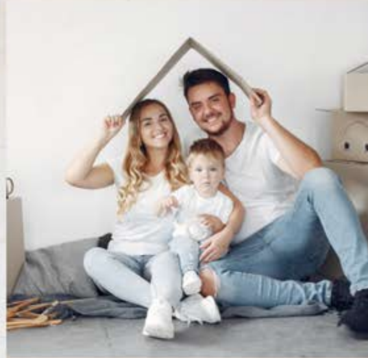
HOME & PERSONAL CARE