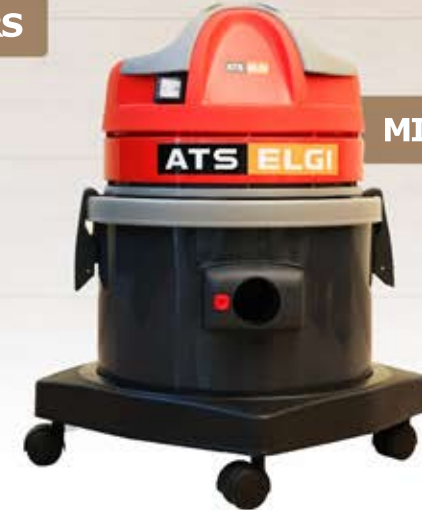
MINI VAC- 17 LTRS