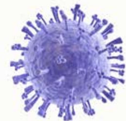
Viruses and microparasites

Antibacterial filter with silver ions (Ag + ions)