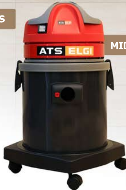
MID VAC- 37 LTRS