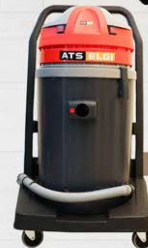
DUAL VAC- 78 LTRS