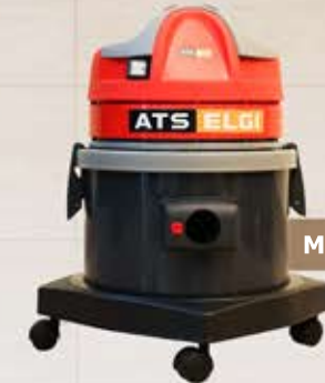
MINI VAC- 17 LTRS