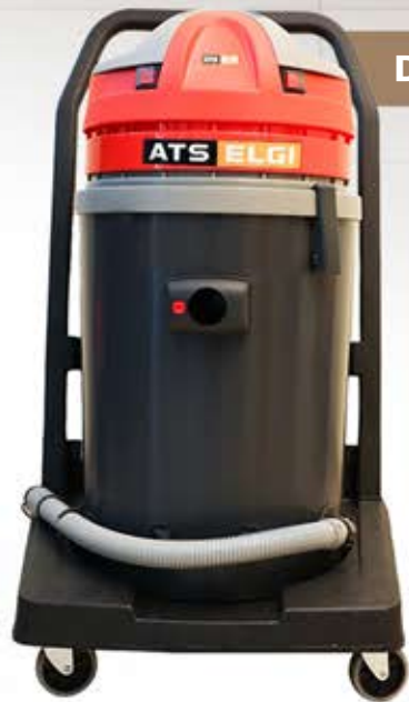
DUAL VAC- 78 LTRS