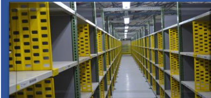
Boltless Shelving systems