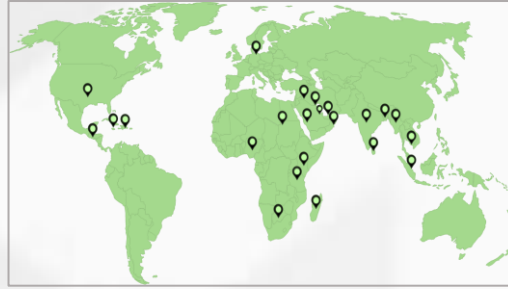
Global reach with strong dealer network