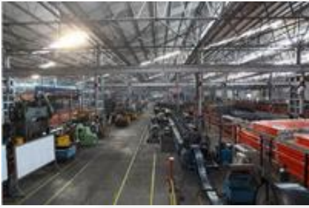
State-of-the-art, high-capacity automated manufacturing facility