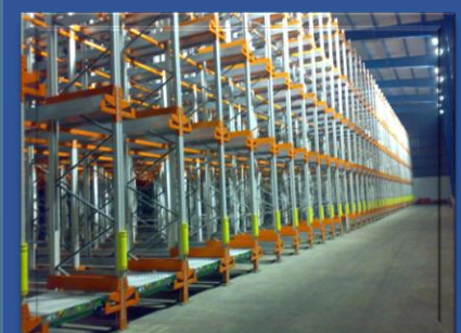
Shuttle Pallet Racking