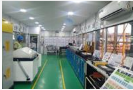
Comprehensive in-house testing facility for assured quality