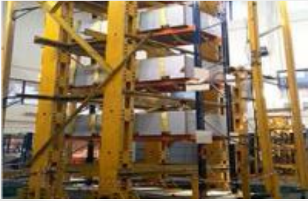
Safety in design – Tested Seismic racking for zone 5 and above